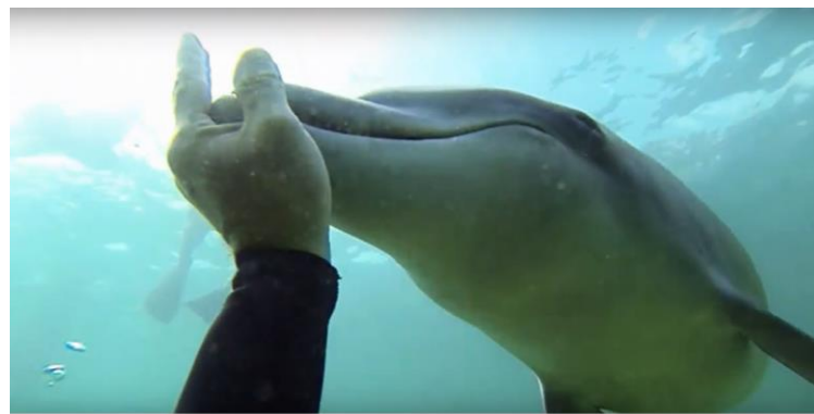
Figure 2: Dolphins being touched during a coordinated, but most likely unregulated, swim experience (top) and during an uncontrolled swim interaction initiated by two jet-ski riders on their own terms (lower). Identifying details have been removed from both images.