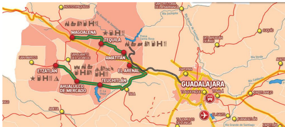
Figure 2: Map of the Tequila Route