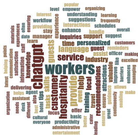
Figure 1. Word Cloud

Based on the participants' responses, the study identified various themes regarding the utilization of ChatGPT. These themes included training and education, customer service support, language assistance, travel recommendations, as well as time management and organization. The interviews were analyzed using content analysis and NVivo software. To facilitate comprehension of the findings, a word frequency query was applied, and the commonly used words by the participants during the interviews were visualized in a word cloud (Figure 1).