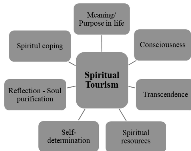
Figure 2: Conceptual Model of Spiritual Tourism

The built conceptual model of spiritual tourism indicates that tourists/travellers are able to purify themselves through many tourist activities such as yoga, meditation, reflection, and others. They are able to reflect upon themselves and realise the meaning- purpose of life. With a purpose in mind, they are motivated to have high self-determination, gained through spiritual resources such as tourist places, nature, interaction with human beings, and others. By increasing knowledge and wisdom through different spiritual resources, tourists will transcend themselves to be the best they can to reach the highest potential of their real self, thus allowing them to gain higher transcendental awareness that leading to high consciousness. High state of consciousness will create a high ability amongst tourists/ travellers to cope with obstacles/ problems in which finally lead them to achieve a great satisfaction and outcome from their travel/ tourist experiences. These descriptions are one possibility as how all the dimensions could be inter-related. This model could be used as a whole or being used individually to reflect the essence of spiritual tourism.