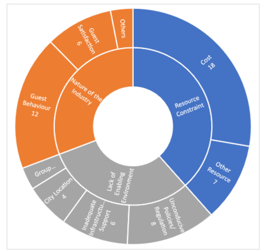
Figure 1: Limitations to adopting and implementing SRM practices

Apart from cost challenges, participants highlighted that shortage of human power, staffing, time constraints and limited space at TAEs hampered the adoption and implementation of environmentally responsible activities. Staffing and time go hand in hand, as ES activities require going over and beyond the normal day-to-day activities of the industry and are ultimately tied to the cost constraint as human power and time cost money. Participants also referred to the availability of space as a significant challenge which results in establishments' inability to sort their waste at source, recycle, cultivate herb gardens for their kitchens or even plant trees to contribute to greening. This challenge was particularly severe for establishments situated in urban/city locations.