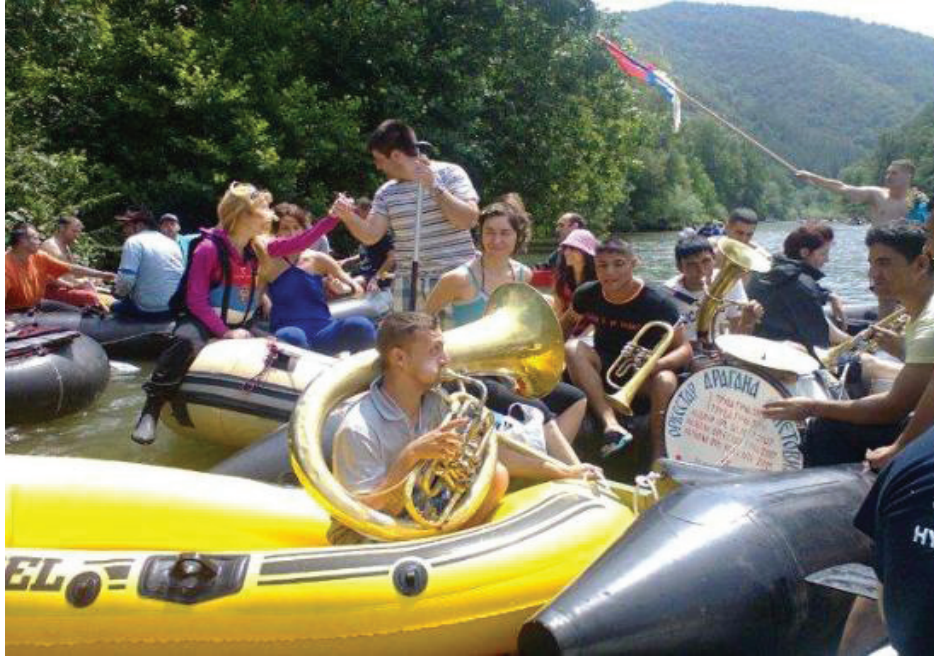
Figure 2. The participants of the sports rafting event “Veseli spust”