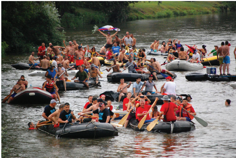
Figure 1. The participants of the sports rafting event „Veseli spust“